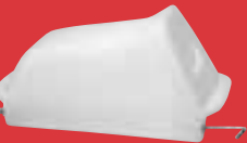
3-Gallon Solution Tank