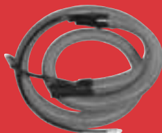
15' Hose w/Solution Line Part # EXT59232-1