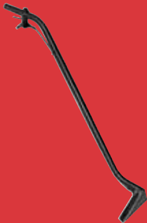
12-inch Carpet Wand Part # EXT59229A

Specifications subject to change without notice.