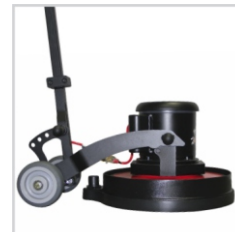
Optional Dust Control Ring Connects to Tank Vac