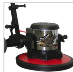
Glide XHD Has Chromed Motor w/ 11:1 Gear Box