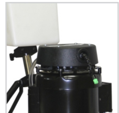
Available with 45 PSI Solution Sprayer