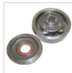
Permanently Lubricated 11:1 Triple Planetary Gears