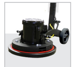
Floating Head Frame