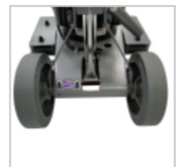
8" Wheels for Easy Transport