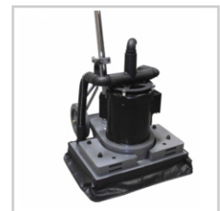
Optional Dust Control Kit