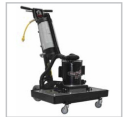
Includes Transport Cart