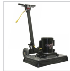
Includes Full Wrap-Around Dust Skirt