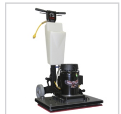
TH2814-SP Adds a Sprayer Pump & 4.5 Gallon Solution Pump