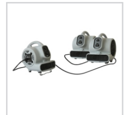
BH20DT Moves More Air with Daisy Chained Power