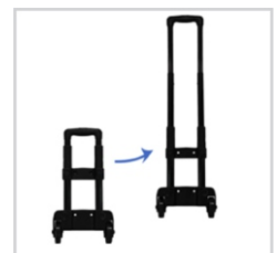
Optional Telescopic Transport Cart for BH50 BH50-WHLKT