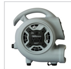
12 Amp Aux. Power Outlet on BH20