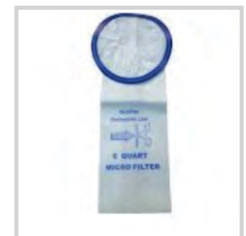
Disposable Paper Vacuum Bags #HPVA005-3