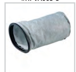
Washable Cloth Bags #HPV-BACK-CLTH BAG