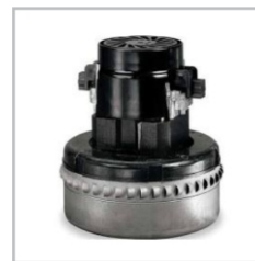
Powerful 1-Stage Motor