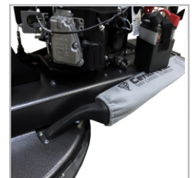
Optional Active Dust Control Kit