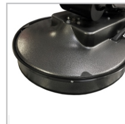
Optional Splash Ring