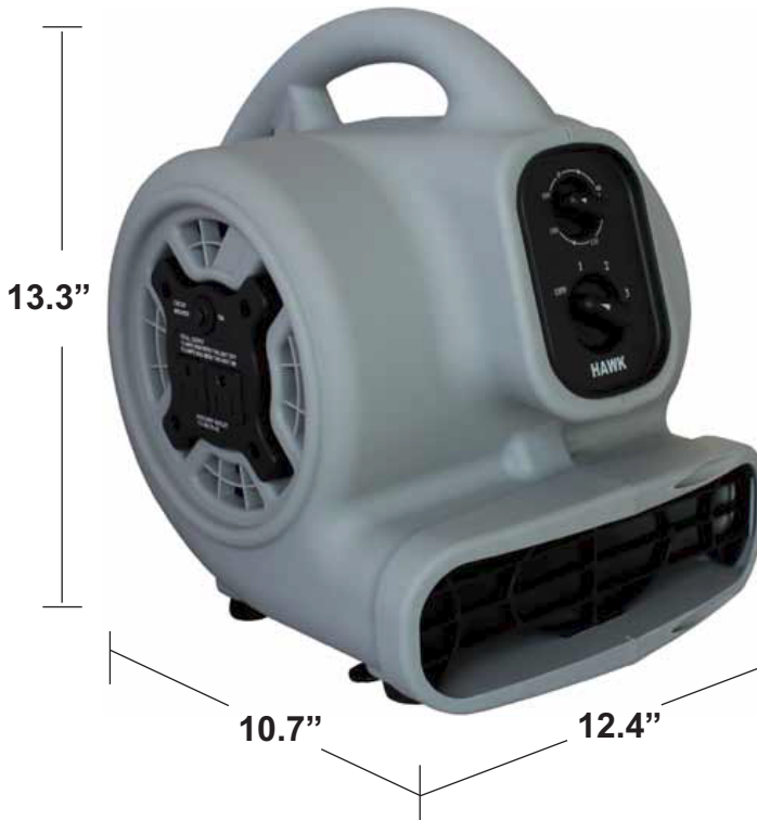
HAWK BH20DT 800 CFM Air Mover