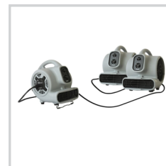
BH20DT Moves More Air with Daisy Chained Power