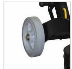
8" Wheels for Transport