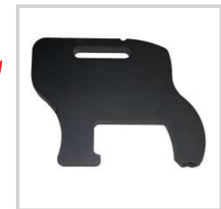
Optional Carriage Weight Kit (28. lbs.)