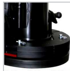
80 lb. Weights Available. Mounts on Apron with Locking Pins