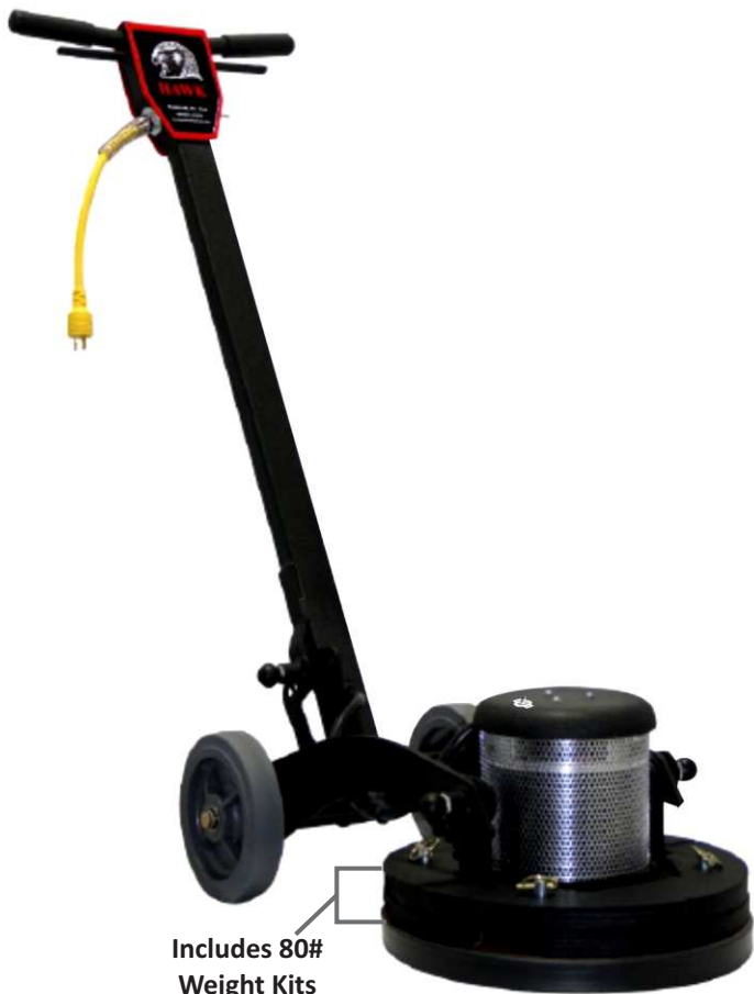
Includes 80# Weight Kits

The Merlin 2-Speed takes advantage of innovative engineering to set new records in production and user safety. The unique “Floating Head” handle carriage design provides 100% contact with the floor, and steers the Merlin in forward and backward movement - unlike the side-to-side movements of traditional swing-buffers. The Merlin 2-Speed draws 1/3 less amps than standard machines. Strip and scrub floors at 165 RPM. Buff and polish at 300 RPM.