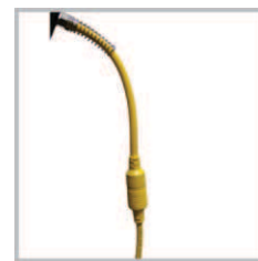
Two-Part Twist Lock Connects Machine to 50 ft. Power Cord