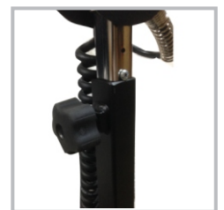
Telescoping Handle Adjusts from 36" to 48"