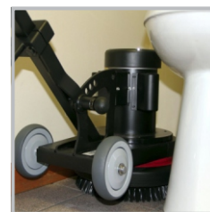
Works in Tight Spaces