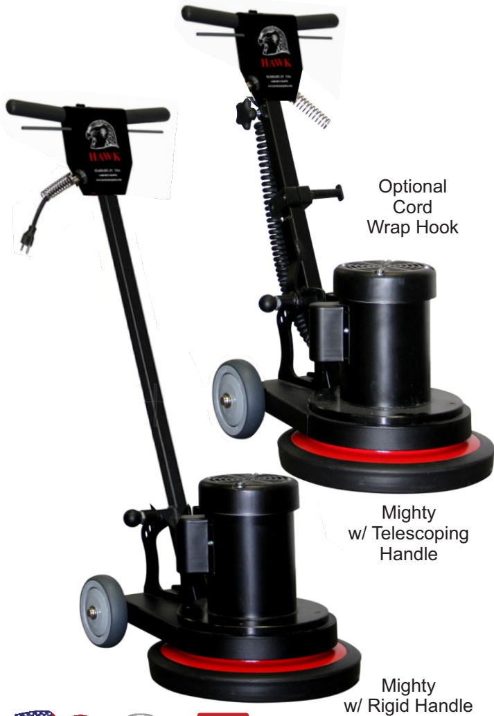
Optional Cord Wrap Hook