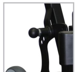
Handle with 6-Position Pin Lock